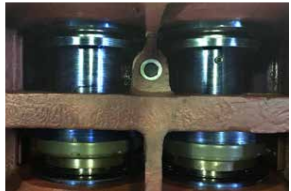
Components (main shafts) for palm oil extract